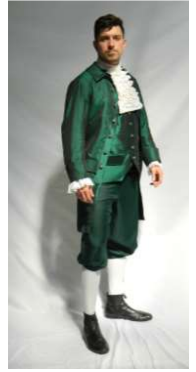
Louis Deluxe; Emerald £60