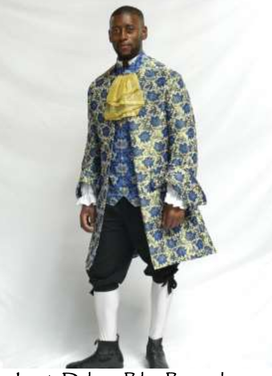
Louis Deluxe; Blue Brocade £60