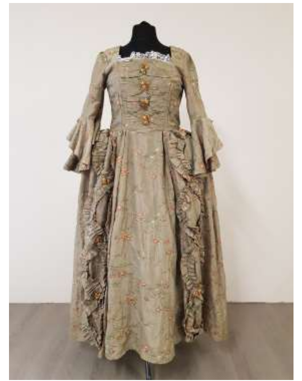
Lady of Versailles, VERS-05 £60