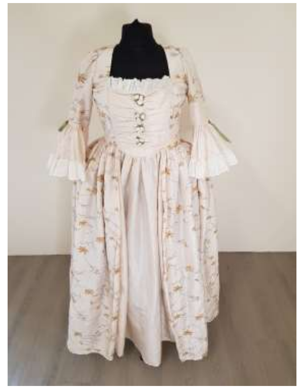
Lady of Versailles, VERS-03 £60