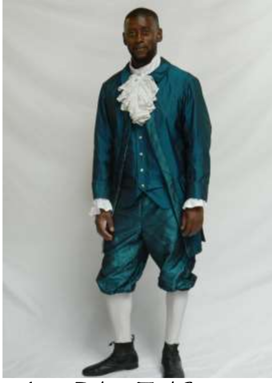
Louis Deluxe; Teal Square £55