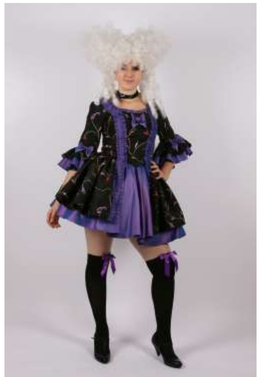
Marie Antoinette; Black & Purple £50