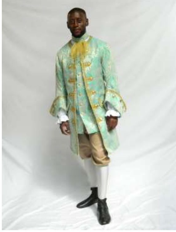
Louis Deluxe; Mint Embossed £60