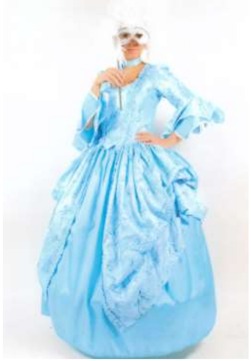
Maríe Antoinette; Powder Sqn £60