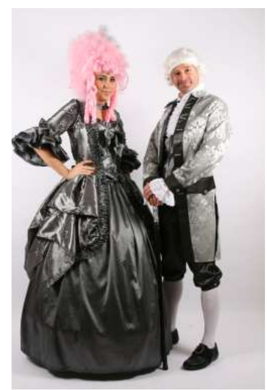
MA-L020, 036, 054 & 055 £60 and £55