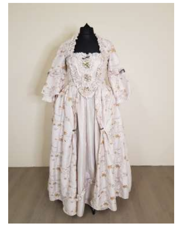
Lady of Versailles, VERS-06 £60