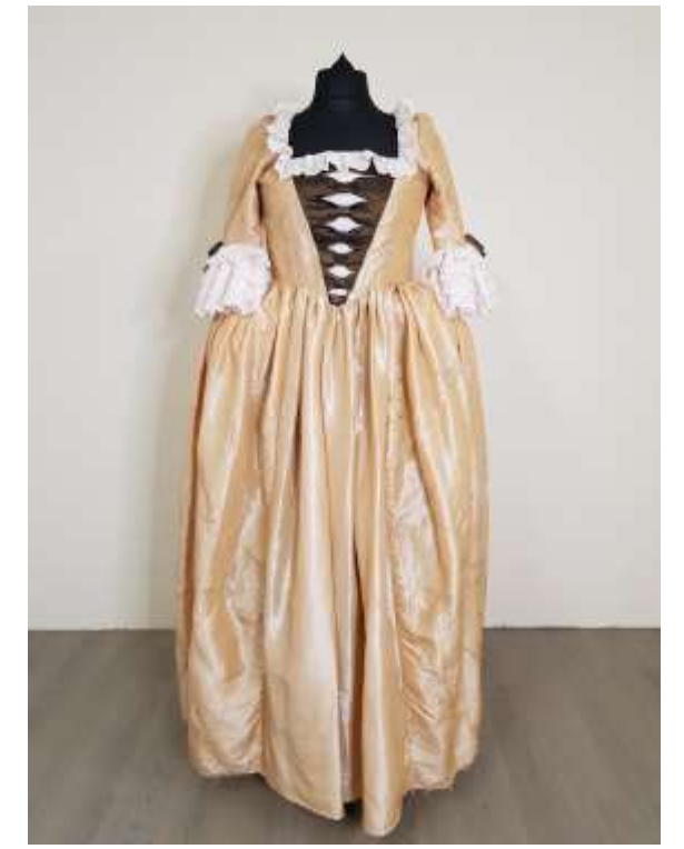
Lady of Versailles, VERS-02 £60