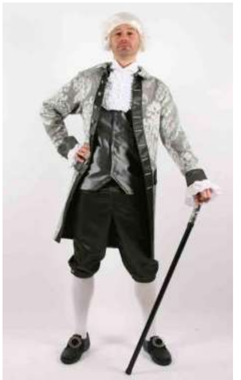
Louis Deluxe; Grey Embossed £55