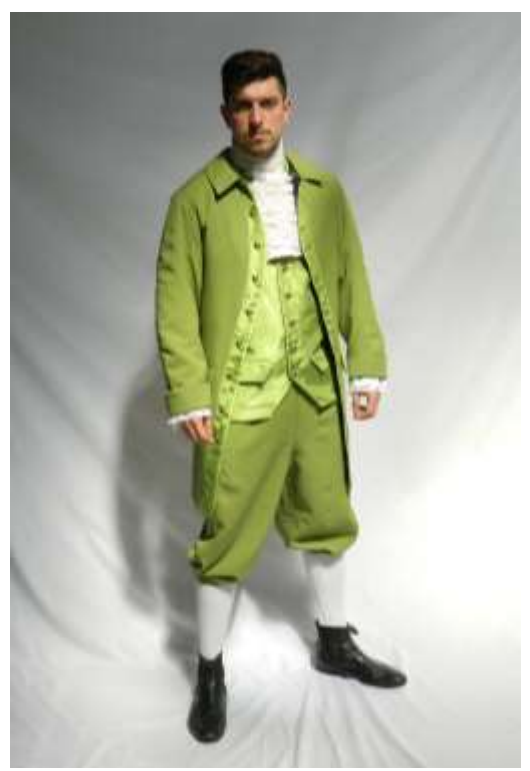
Louis Deluxe; Lime £55