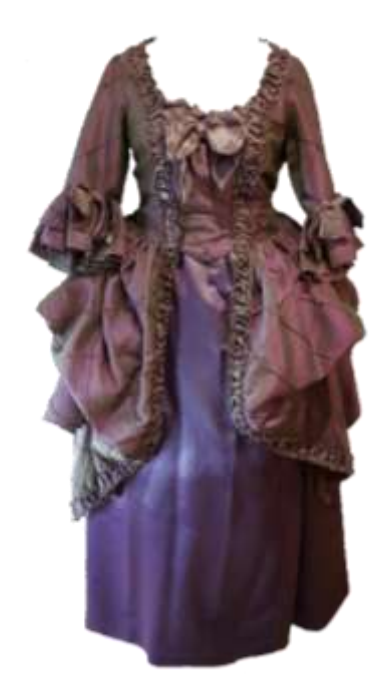
Marie Antoinette; Purple Beaded £60