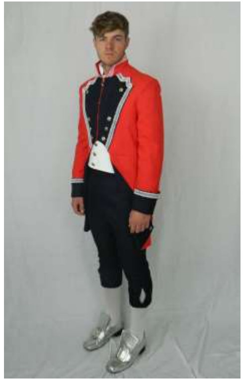
Prince Charming; Deluxe Red £55