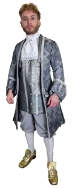
Louis Deluxe; Grey Wave £65