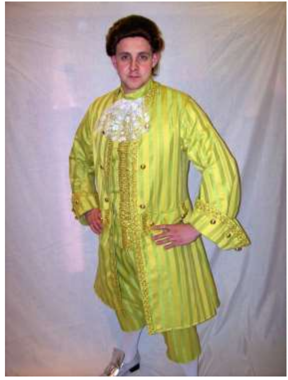
Louis Deluxe; Lime Stripe £60