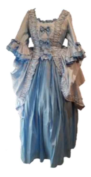
Marie Antoinette; Blue White Stripe £60