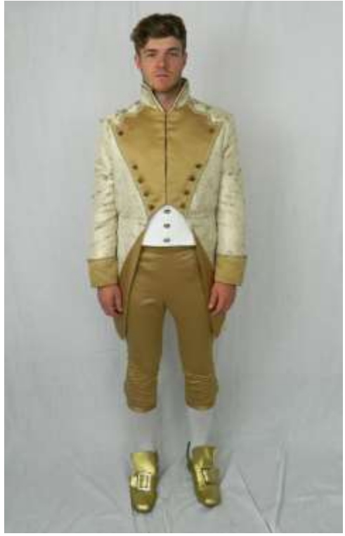
Prince Charming; Deluxe Gold £55