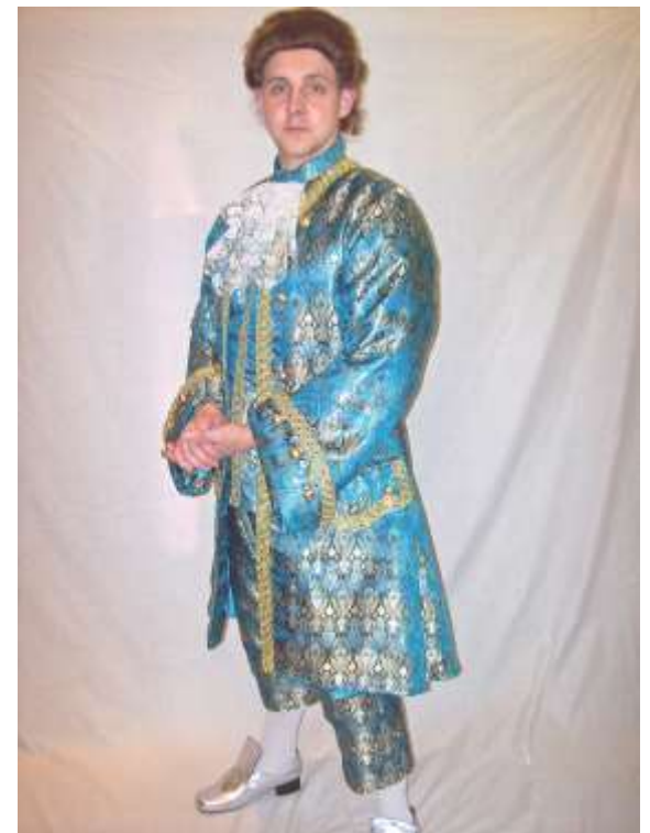
Louis Deluxe; Turquoise & Gold £60