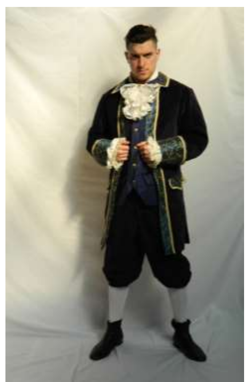
The Prince £55