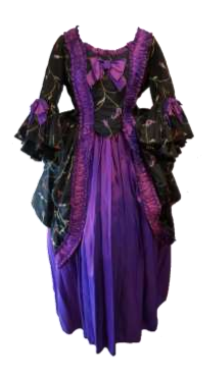
Marie Antoinette; Black & Purple £60