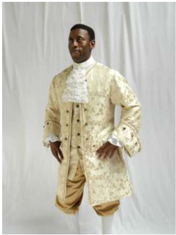
Louis Deluxe; Gold Brocade £60