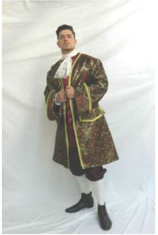
Louis Deluxe; Burgundy & Gold £60