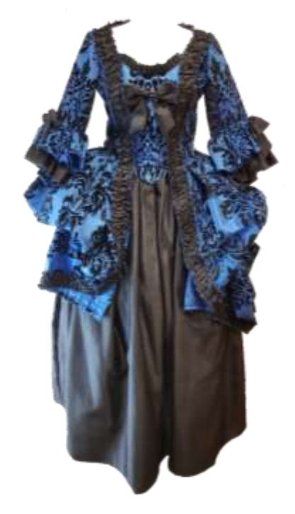
Marie Antoinette; Royal Blue 600